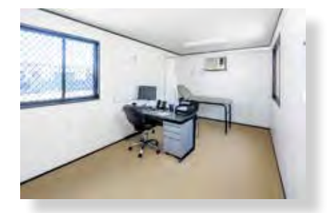
Furnished First Aid Room