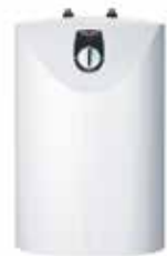
Underbench Hot Water System

* Please note furniture items may vary in appearance from region to region depending on stock availability.