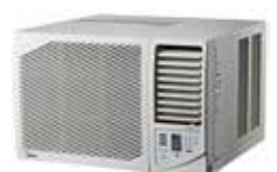
Reverse Cycle AC