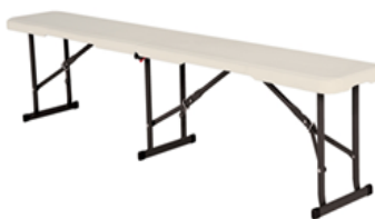
Bench Seat Bi Fold